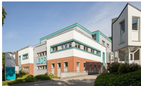
LADR Group, Geesthacht, Germany (Aug-22)