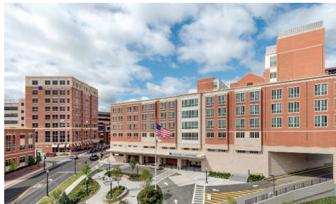
Albany Medical Center, NY, United States (May-22)