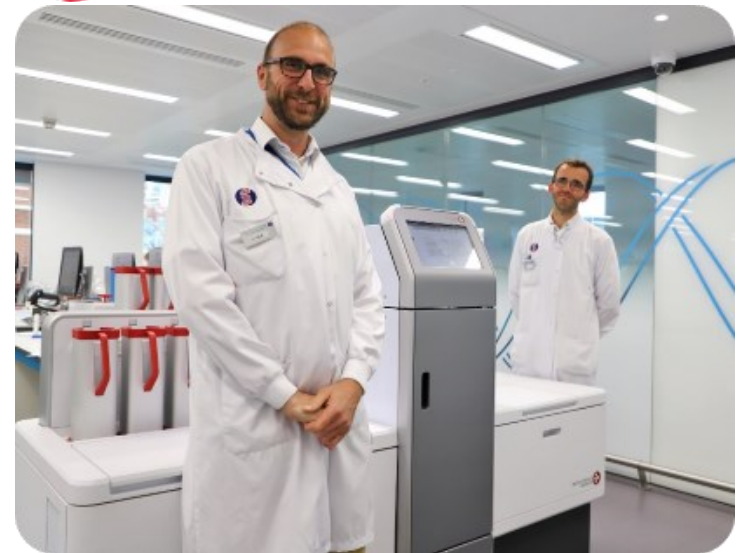
APAS® Independence in action at Health Services Laboratory, UK